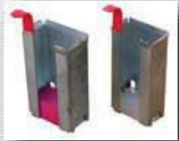
Medical alert tags & dog tags