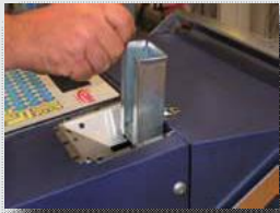
Interchangeable input hoppers for dog tags and medical alert tags for easy change