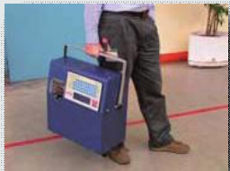
Easy to carry handle