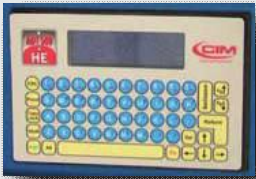
Integrated standard keyboard